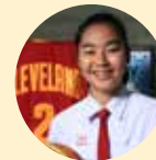
Pinda V. Sport Crew