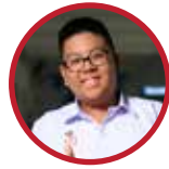
By Nattakrit Kongphichipan (M4/8)