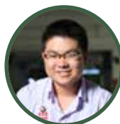
By Ruiqi Zhang M.4/8

"LET SILENT CONTEMPLATION BE YOUR OFFERING".