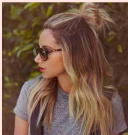
By Partita Damrongrajchasak M.1/8