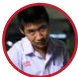
By Pataraphol Pholngam M.2/8