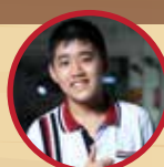
By Khopher Sunthonkun M.1/7