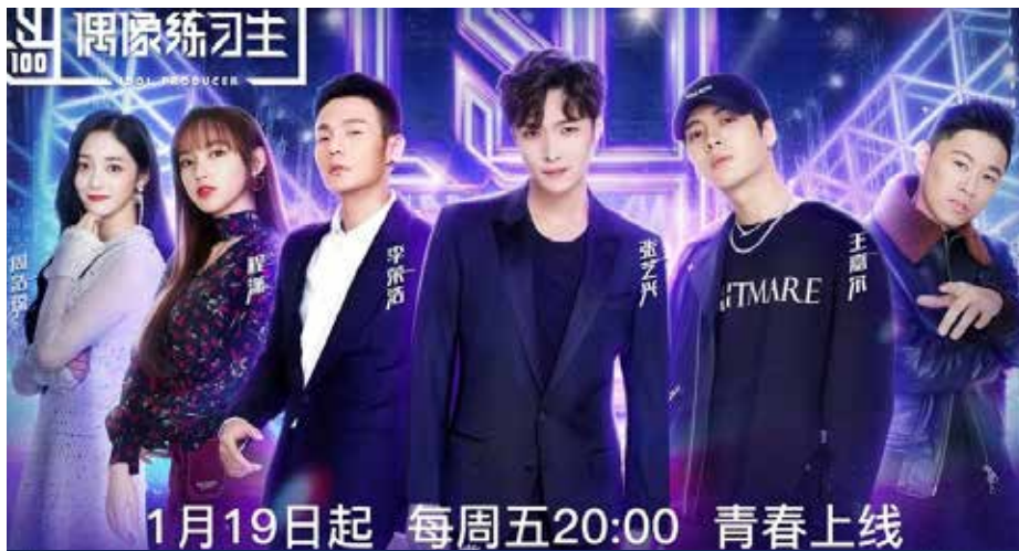
1月19日起 每周五20:00 青春上线