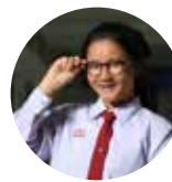
By Thitichaya Kititarakul M.5/8