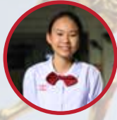
By Ketmanee Kamolmongkolsuk M.2/7