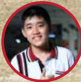
By Khopher Sunthonkun M.1/7