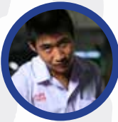
By Pataraphol Pholngam M.2/8