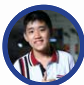
By Khopher Sunthonkun M.1/7

For me the activity was very fun. My group also performed and we tried our best. I think I really enjoy the activity and I think every teachers, students and parents did too.