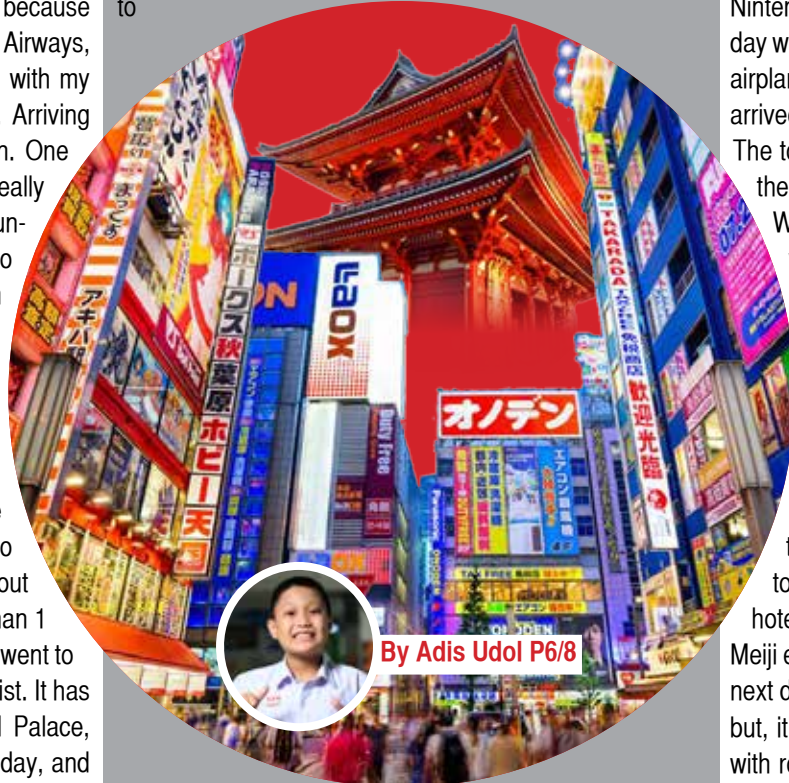
By Adis Udol P6/8

kept walking and taking pictures and walking until we got tired of it. We walked back to the train station and depart to