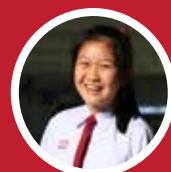
By Phakinee Sirivoravit M.5/8